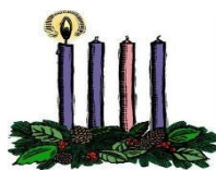
First Sunday in Advent